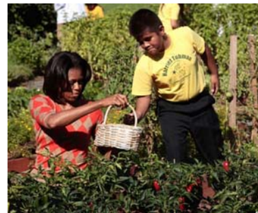
Michelle Obama in the White House Kitchen Garden with local elementary students the day after GDMS visited the garden.